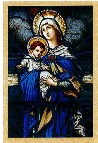
Mary, Queen of the Sea

The large stained glass window is titled Mary, Queen of the Sea; above it is the Archangel Raphael.